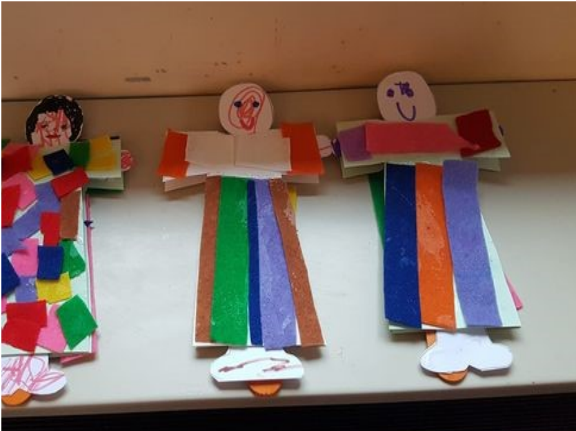
Joseph's Coat of Many Colours

We are also really blessed in our kitchen team who provide a hub for quieter sharing and hugs as needed.