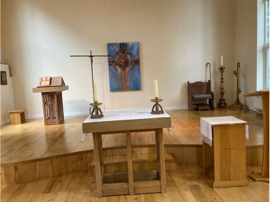
The Font in the chapel