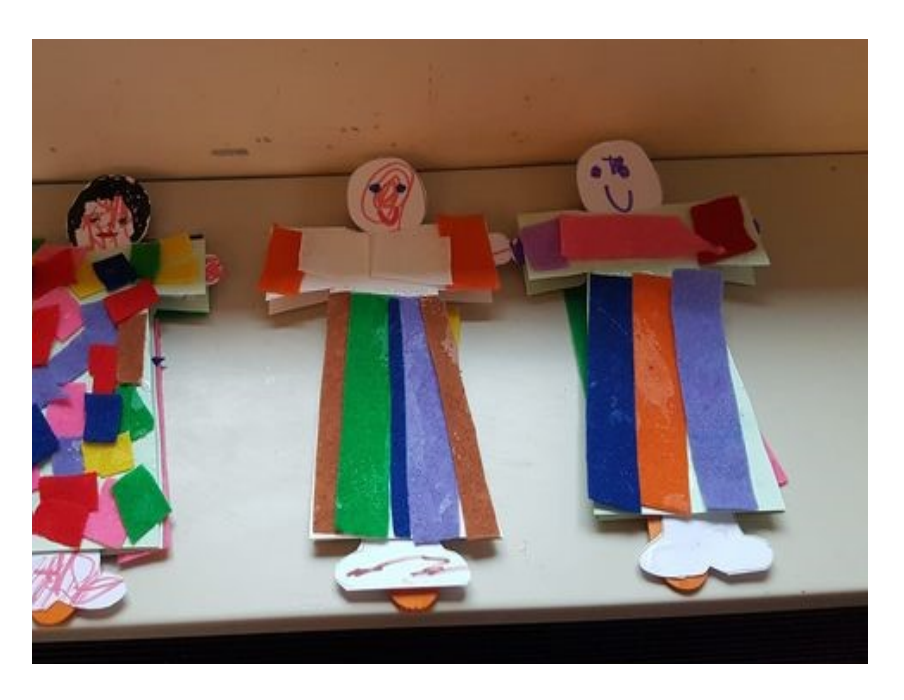
Joseph's Coat of Many Colours

We are also really blessed in our kitchen team who provide a hub for quieter sharing and hugs as needed.